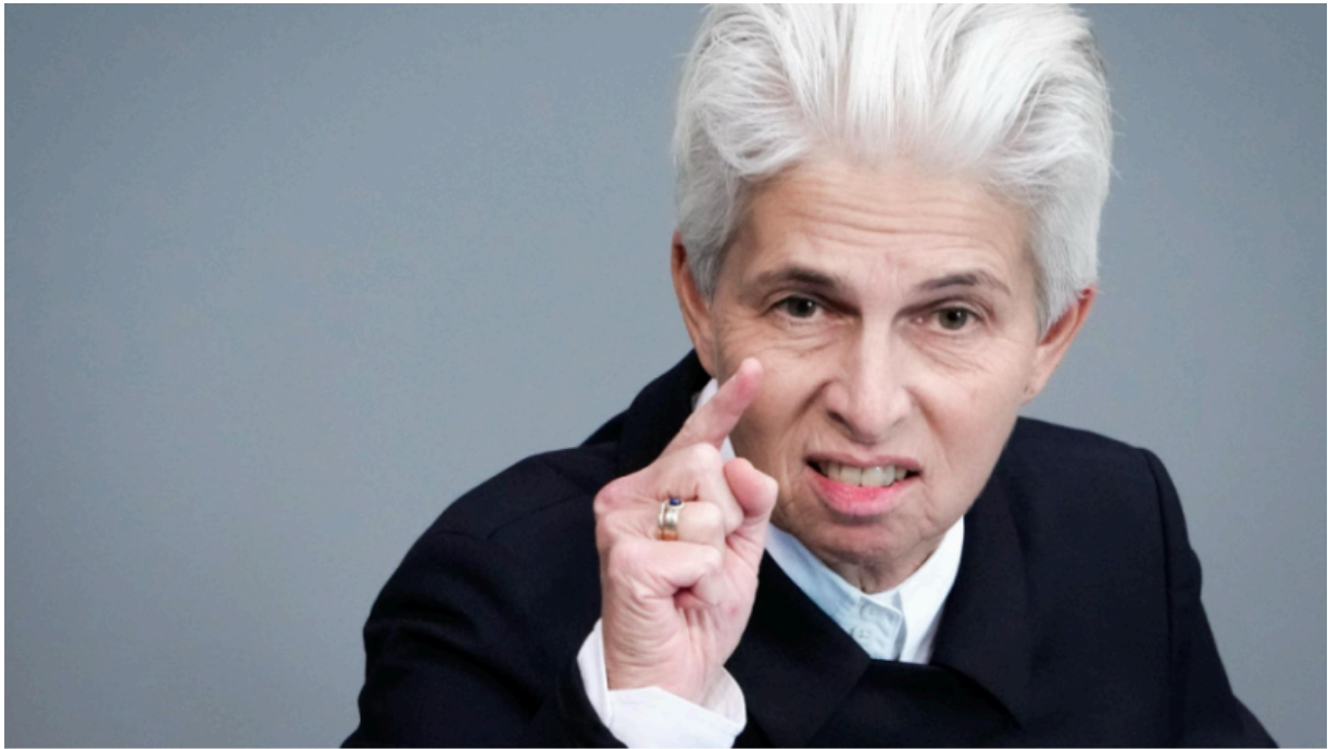
Marie-Agnes Strack-Zimmermann: Form follows function

MARIE-AGNES STRACK-ZIMMERMANN, 19 MARCH 2026