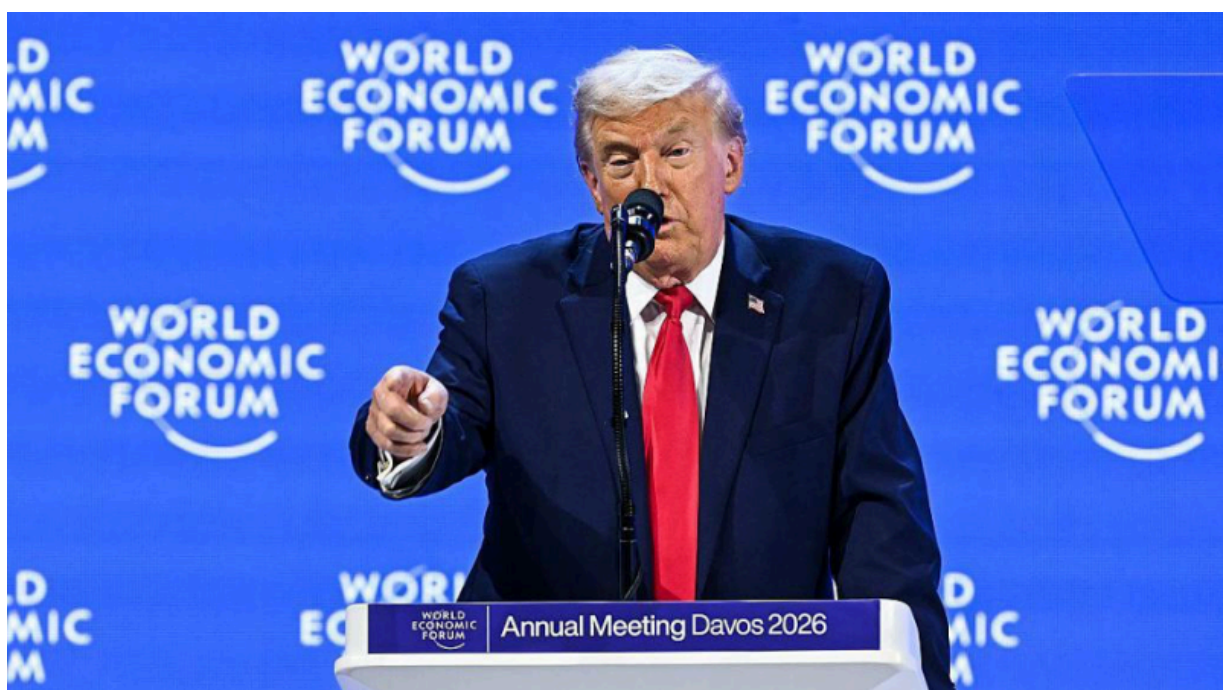
President Trump, WEF, Davos, January 21, 2026

On January 21, Trump said that “the world is not safe unless we have complete and total control over Greenland.” In his Davos speech on January 21, he announced that “we [NATO] never wanted anything or never got anything” – all the United States wants is a place called Greenland. He went on to say, “I don't have to use force. I don't want to use force. I won't use force.”