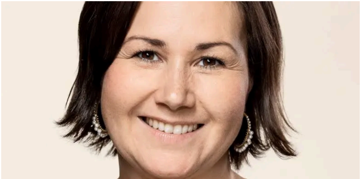
Aaja Chemnitz – Greenlandic parliamentarian

Trump's strategy could work: he threatens war, the Europeans organize a dwarf rebellion, Trump threatens punitive tariffs, announces that he will not use military force, and the dwarfs do what they do best and settle for a compromise – at Greenland's expense, of course. Trump further announced on True Social : Based upon this understanding, I will not be imposing the tariffs that were scheduled to go into effect on February 1st.