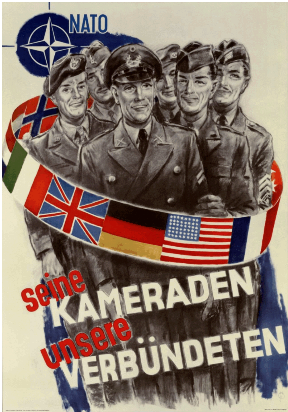
We are friends again - NATO propaganda

The deep state discovered the new enemy and used its puppet Truman and his herald Churchill to demonize him. It was not the criminals in Germany who were demonized, but those who really won the war and at the same time made the