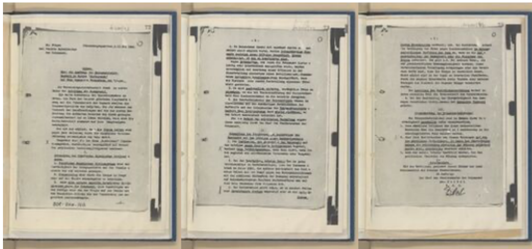
Facsimile of the Kriegsgerichtsbarkeitserlasse

The order is central to the genocide in several regards: