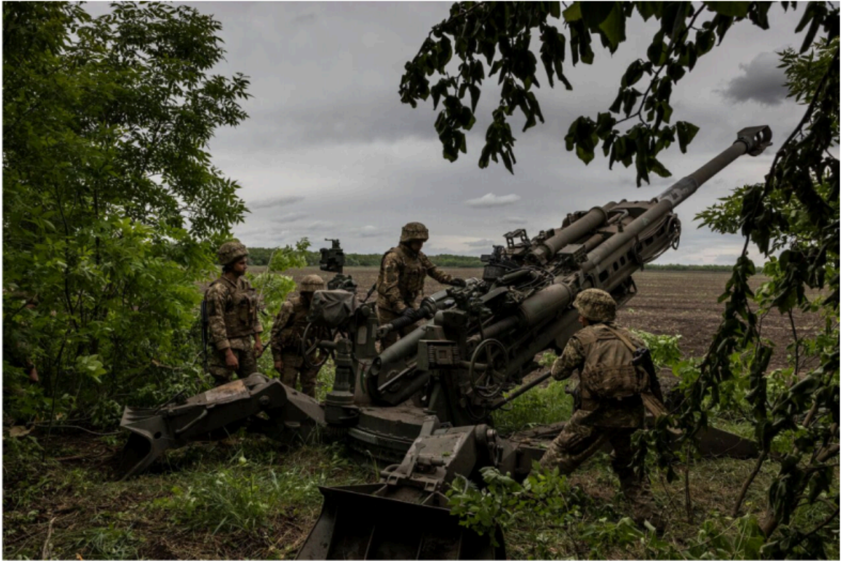
▲ Ukrainian soldiers prepare to fire an M777 howitzer at Russian forces in the Donetsk region.

Islamic Republic News Agency, December 12, 2025