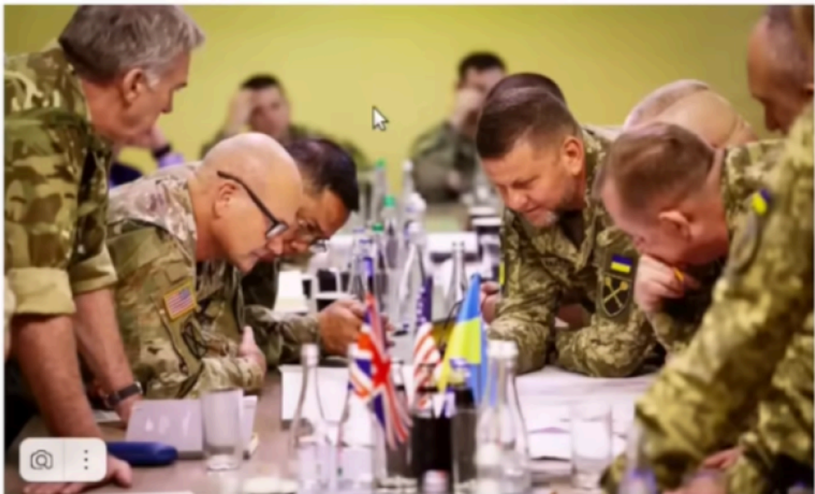
Ukrainian, American and British military leaders during a meeting in Ukraine in August 2023. Valerii Zaluzhnyi

In 2014, the United States overthrew the elected government of Ukraine. They put a regime loyal to them in power. According to the New York Times , the Central Intelligence Agency took over all Ukrainian intelligence services. We recall that the US, together with NATO, restructured and trained the Ukrainian military from 2014 to 2022. Among other things, we have this article from the New York Times, The Secret History of the War in Ukraine , about how the US is waging the entire war against Russia from Wiesbaden, Germany.