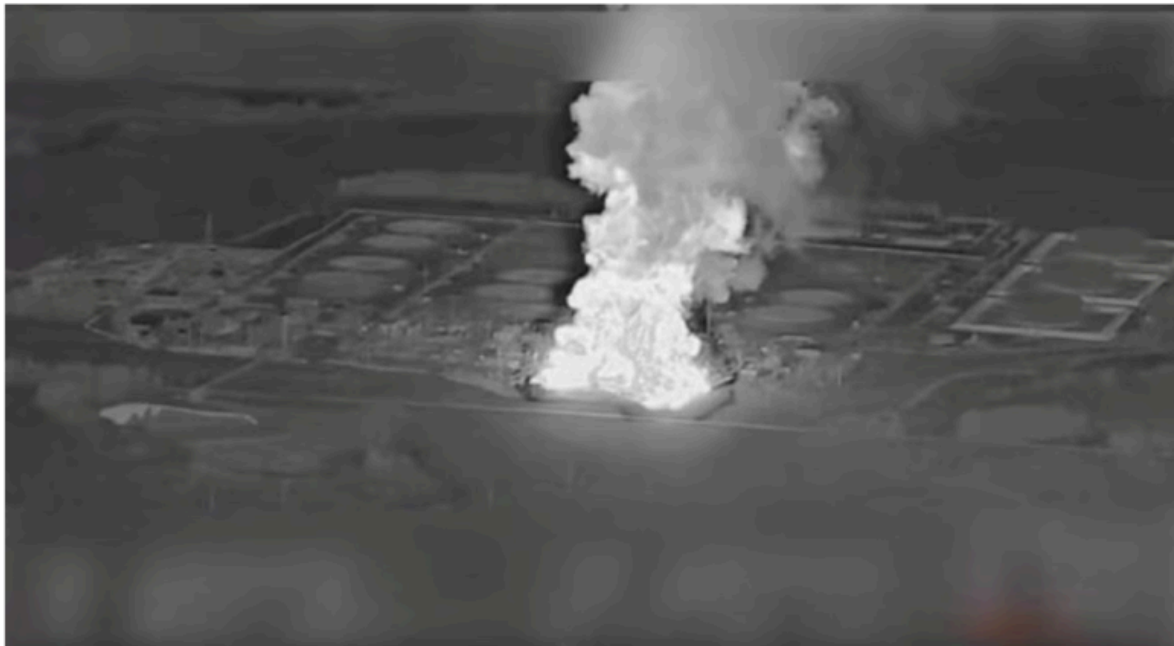
Smoke rises from the Unecha oil pumping station during a fire, in Unechsky district, Bryansk region, Russia, August 21, 2025 in this night vision still image obtained from social media video.

The US is waging this war against Russia. To do so, it is using Ukraine and Europe. It is America's war. They started the war. They are waging the war. Without the US, the war could not continue.