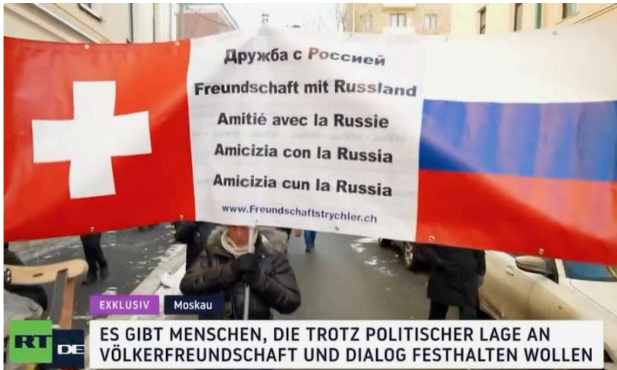
Friendship with Russia – January 26, 2026, in Moscow